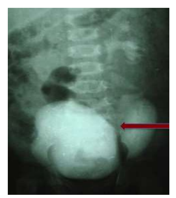
Fig. 1. IVP showing dilated ureter in the entire course (red arrow).

A 2-year-old male child presented with pain in abdomen and crying during micturition. There was no history of urinary tract infections. The general as well as systemic examination findings did not show any abnormality. Results of the blood, urine, and culture were negative. Abdominal ultrasound showed a normal right kidney and ureter, a hydronephrotic left kidney measuring 8.2 \times 3.1 \times 4.2 cm, hydroureter with uniform dilatation measuring 12 mm, and a normal bladder. The MCU was normal; there was no evidence of reflux; and intravenous showed pyelogram (IVP) mild hydronephrosis, massively dilated and tortuous left lower ureter, and moderate hydroureter in the mid and upper ureter [Fig. Diethylene-triamine-penta-acetic acid 1]. (DTPA) scan showed delayed excretion of dye on the left side with t_{1/2} more than 20 min. Dimercaptosuccinic acid (DMSA) scan showed reduced function on left side, the differential being 29.7%, and absence of scars. A diagnosis of left obstructed megaureter was made and the child was posted for elective surgery. Intraoperatively, the left ureter was mobilized extravesically to find a normal ureterovesical junction and a normal distal ureter up to 5 cm from the ureterovesical junction proximal to which ureter was dilated.