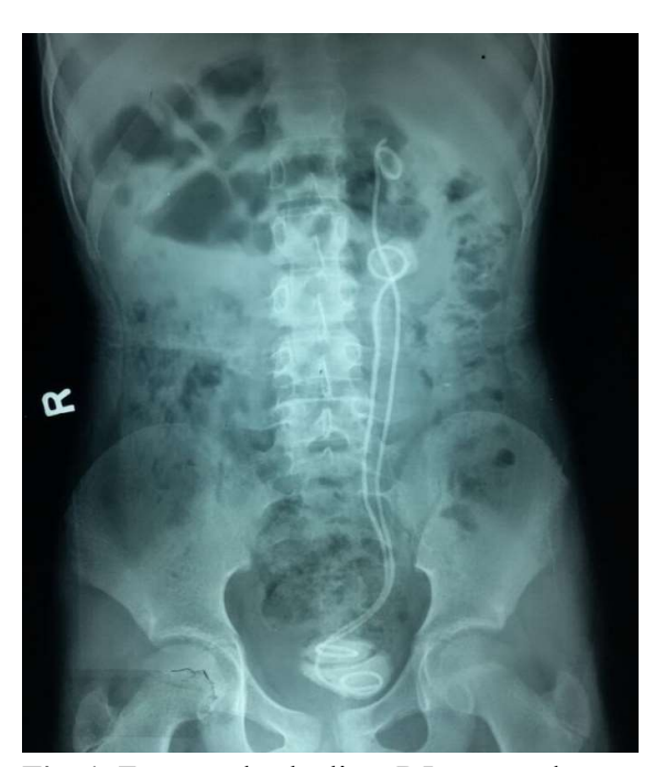
Fig. 1. Encrusted calculi on DJ stent ends.

Radiological investigations showed that not only were there retained DJ stents, but there were also encrusted calculi on their ends. An X-ray revealed the picture [Fig. 1].