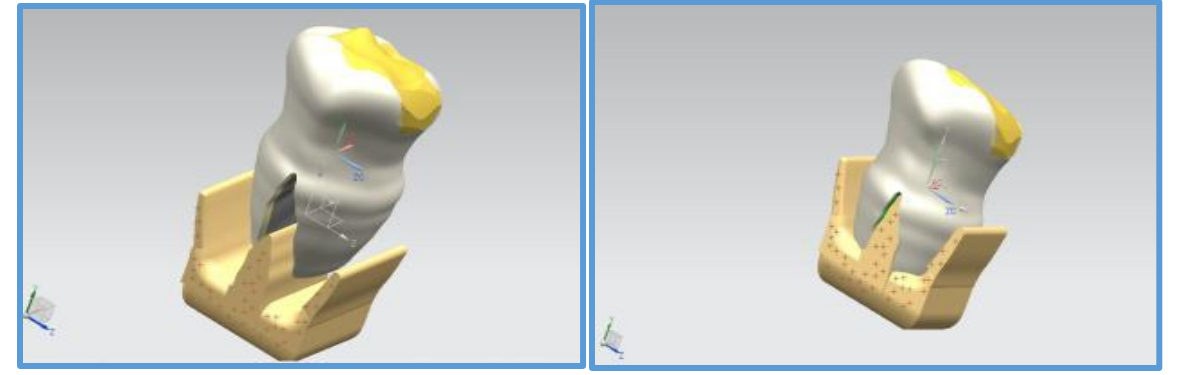
Figure 1: Three-Dimensional Model and Inlay Volume Created