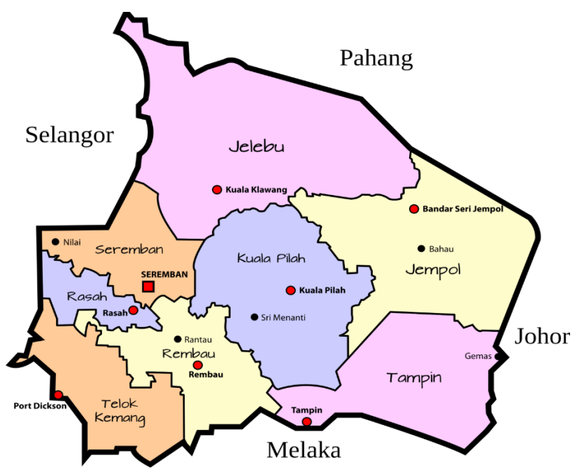
Figure 1: Map of Negeri Sembilan showing Various Districts and towns

Below is a comprehensive map of Negeri Sembilan State where the research work was carried out.