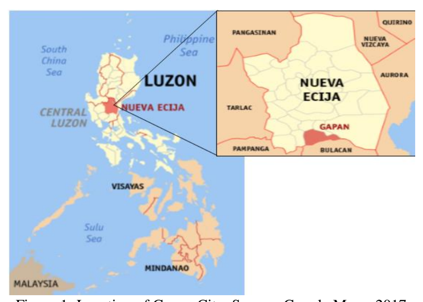
Figure 1: Location of Gapan City.

The study locale is the Division of Gapan City, one of the school's divisions of the Department of Education Region III, Philippines [8].It is composed of 41 public schools, 33 of which are elementary schools and the 8 are secondary schools. As of July 2017, it is composed of 41,386 students [9] and 1,086 employees [10].