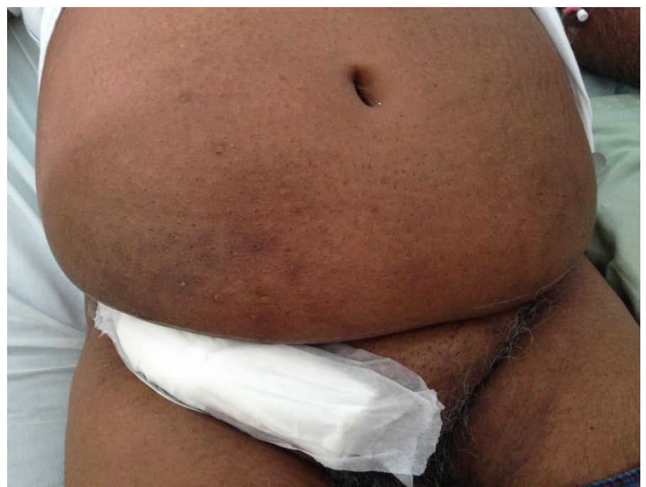
Figure 1: Photograph of the patient's abdomen and groin

Physical examination revealed a middle age obese patient with no obvious cardiopulmonary distress. The mucous membranes were moist and pink. The vital examinations were normal. Abdominal examination revealed a large protuberant abdomen (Figure 1) with no visible mass or hernia in the right groin. However, mild tenderness was noted in that area on deep palpation. Rest of the abdominal and systemic examination were normal. Routine blood examinations were within normal limits except mild leucocytosis. Plain abdominal radiographs were normal. A CT abdomen and pelvis was done with intra venous contrast revealed a 5 \times 5 cm right femoral hernia with a 3cm diameter neck containing omentum only (Figure 1).