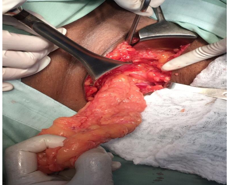
Figure 4: Intraop photograph showing omentum as the content of the sac

The patient had an unremarkable post op recovery and was discharged on day 3 postsurgical repair. Patient has been followed up in the surgical outpatient clinic and at 2 years follow up the patient was doing fine with nil complaints or sings of recurrence.