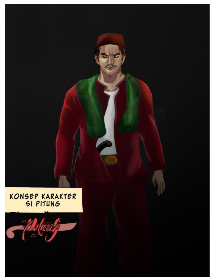
Figure 3.5: character of the Pitung Ilustration byNico Sandjaya

The logo of the pitung in this digital comic focuses comic concept focused on the age of the students, whose purpose is to invite the students to watch the comics made by the children of their own country. On the basis of the segmentation, the author makes a slightly interesting logotype. The font is designed like handwriting and red colored. The red color here symbolized by one of the bold Pitung's character, red font and color is also designed to get the impression of exclusive and elegant because it is shown for the age of over 15 years. To add to the masculine impression of the figure of Pitung.