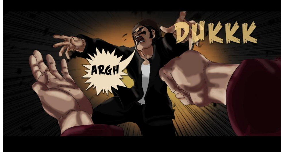
Figure 3.2: Rescue Si Pitung fight with a mask Ilustration byNico Sandjaya

Illustrations in the illustrations can be seen clearly the character of the Pitung as a champion or whiz with just memperliatkan fist picture so sturdy that drawings that Si Pitung is a knight always defend the society cannot afford. Detailed hand drawings and then mimic the character of the villain has a very perfect whiz.