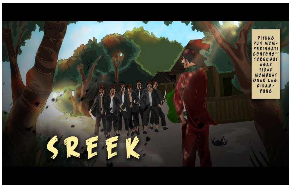
Figure 3.2: Rescue Si Pitung fight with a mask Ilustration byNico Sandjaya

Illustrations in the illustrations can be seen clearly the character of the Pitung as a champion or whiz with just memperliatkan fist picture so sturdy that drawings that Si Pitung is a knight always defend the society cannot afford. Detailed hand drawings and then mimic the character of the villain has a very perfect whiz.