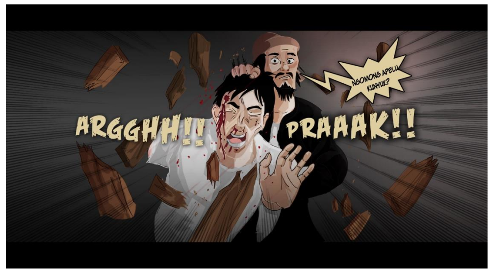
Figure 3.1: Fighting scenes Ilustration byNico Sandjaya

Illustration In a fight with the martial arts of pencak silat, the characters or mimic in the illustration with the head restrained with the blood tetesa. Sentences that are made very precise by adding a sentence that menyatak kesaikitan. Plus the effect of the image that gives the impression looks i pitung a hero