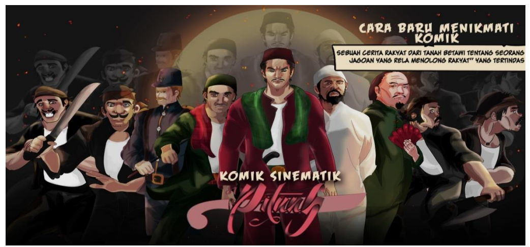
Figure 3.8: character Dutch portIlustration byNico Sandjaya

The other antagonists are the centengs. Actually the centeng-centeng is a champion-martial arts master with great ability. The jawara were usually hired at high prices by the landlords or by the Dutch government. The inhabitants also believe that the champions possess immune sciences and so on, so it is feared by the inhabitants. They are identical with black-colored outfits, with ghostly looks, even bias and expert and use sharp weapons like machetes, axes.