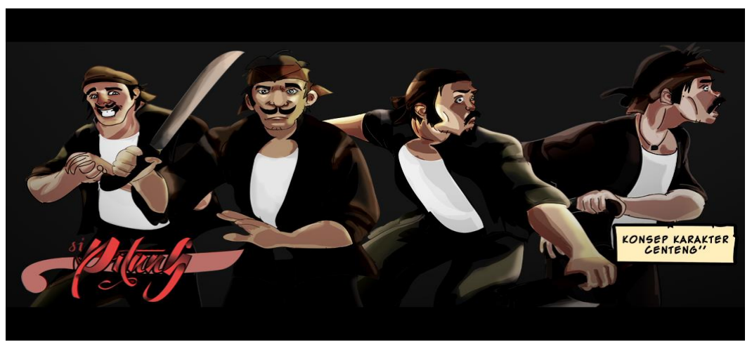
Figure 3.8: character Dutch port Ilustration byNico Sandjaya

The character depicted in a typical Dutch royal army dress is pinned for gray trousers plus commando stick and ruthless and cruel expression.