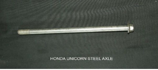
Figure 1: Honda unicorn steel axle

The steel used in the current axle of Unicorn vehicle of honda company. The strength is the most important matter in the axle and weight is also important fact of the vehicle parts.