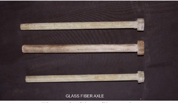
Figure 3: Glass fiber axle

Glass fiber is a material consisting of numerous extremely fine fibers of glass. Glassmakers throughout history have experimented with glass fibers, but mass manufacture of glass fiber was only made possible with the invention of finer machine tooling.