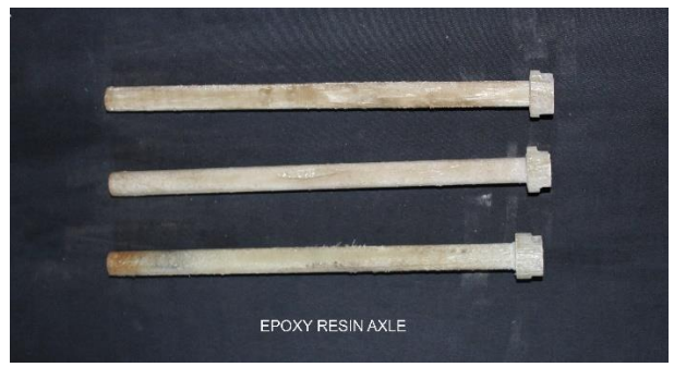
Figure 2: Epoxy resin axle

Epoxy resin is also compatible material in modern mechanical parts. It was also taken in the study.