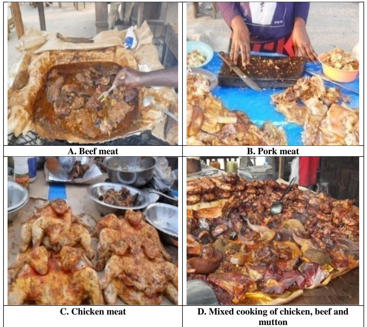
Figure 2: Picture showing the kind of meat collected