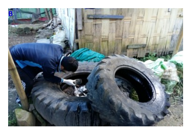
Figure 1 | Vector-mosquito control. A. Space spray/fogging; B. Source reduction.