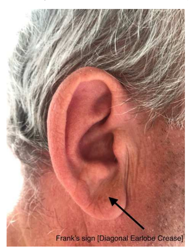
Fig. 1. Photograph shows the diagonal earlobe and preauricular creases

Case 1 presentation. A 61-year-old man presented to the emergency department with 5-hour burning chest pain non-responsible to sublingual nitroglycerin, irradiating to the left shoulder, associated with dyspnea. His has a history if long-standing hypertension, positive family history for hypertension and cerebrovascular disease. Physical examination noted diagonal (Frank's sign) and pre-auricular creases in both earlobes (Fig. 1).