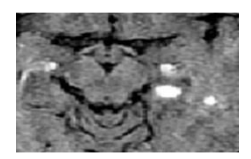
Figure: Acute left hippocampal lesion

DIR & FLAIR sequences have detection rates difference between juxta-cortical white matter & mixed white - gray matter which is a distribution of the MS lesions. A higher number of the mixed white - gray lesions can be detected [5]. In the light of currently performed histopathologic research studies it is revealed that intracortical lesions were observed frequently in the patients of MS, those intracortical lesions detection has become very important for the prognostic and diagnostic interest [12]. Racial variation was approved by two various studies of MS which includes Caucasians and American research carried out on the white and black. Lower risk factor in the blacks about the MS was not proved in these research studies as there is a possibility of the low levels of the vitamin D. It never explains the Asians and Hispanics face low risk factor of the MS against whites, on the other hand that why risk was higher in the black women about the MS [13, 14]. Same outcomes have been produced in our research when we compared Pakistani population with the Canadian population, we also observed women dominance in the incidence of MS.