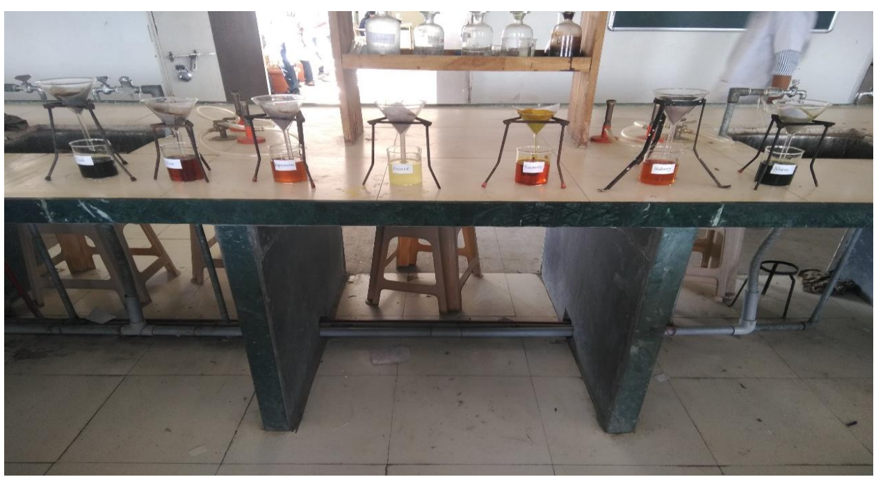
Filtration of Extract