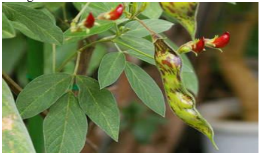
Fig. 1: Cajanus Cajan

Plant derived substances have recently become off great interest owing to their versatile application [1]. Medicinal plants are rich bioresources of drugs [2]. A number of interesting outcomes have been found with the use of a mixture of natural products or plant extracts to treat disesses.3The antimicrobial property of plants have been investigated by a number of researchers worldwide through thorough biological evaluation of plants extracts is vital to ensure their efficacy and safety. These factors are of important if plant extracts are to be accepted as valid medicinal agents for the treatment of infectious disease [4]. Especially in light of the emergence of drug resistant microorganisms.