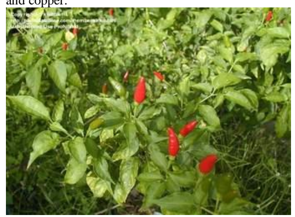
Fig. 2: Capsicum annum

Capsicum annum6 belong to the family Solanaceae, commonly called chilli plant, locally in south India. It is widely used in food. Capsicum annam contain vitamin A, B., C, and E. with minerals like molybdenum, manganese, folate, potassium, thiamin, and copper.