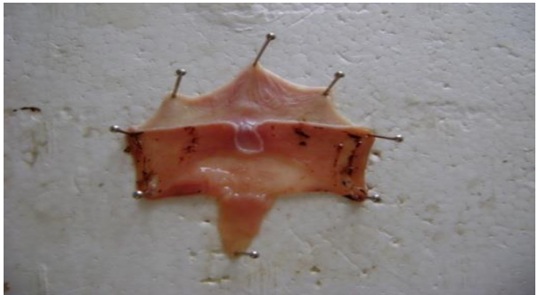
Fig. 1: Group I (CONTROL)

MACROSCOPICAL VIEW OF RAT STOMACH After mounting the rat stomach on glass slide and observed in 10x magnification, different scores were