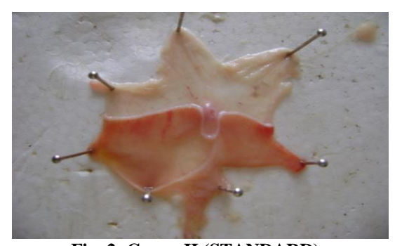
Fig. 2: Group II (STANDARD) A significant reduction was observed in the activity of standard drug Ranitidine in the Diclofenac sodium induced animals.

Oral administration of 20mg/kg b.w. of diclofenac sodium caused a significant (p < 0.05) increase in the degree of ulceration in the rats.