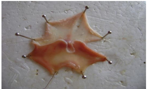
Fig. 4: Group IV (DOUBLE DOSE)

Before screening the test extract for antiulcer activity, the extract was undergone to the acute toxicity studies as per OECD guide lines no. 420 (fixed dose method). The extract was established to be nontoxic at 2000mg/kg as indicated by the mortality in the treated group. Hence, the 2000 mg/kg was treated as cut off tolerable dose, 1/10th (200mg/kg), and 1/5th