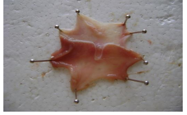
Fig.3: Group III (SINGLE DOSE)

Extracts at 200mg/kg b.w. and 400mg/kg b.w. regimen resulted in significant improvement in these parameters and the observable effects compared well with both normal control group and standard drug (Ranitidine) employed in the study.