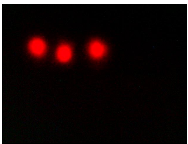
Fig 1. Photomicrography of acellnucleotid of the animal administrated with 1 ml of the drug (%TDNA=3.59); ×200.