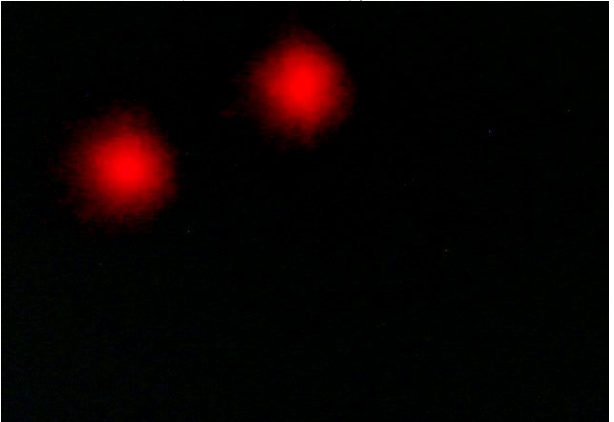
Fig 3. Photomicrography of acellnucleotid of the animal administrated with the placebo (%TDNA=4.39); ×200.

Analysis of the micronucleus test results showed that the carbamylateddarbepoetin in the studied concentrations (single dose subcutaneously in maximal volume of 1 ml (subtoxic dose) and multi dose delivery for 4 days subcutaneously at the dose of 50 \mu g/kg) and negative control did not cause the