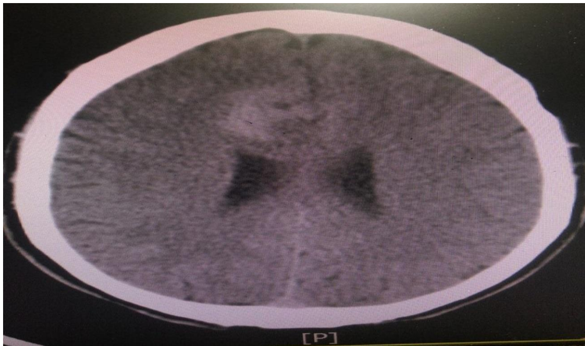
Fig 1: The CT scan is done, which, as it can be seen, there is a lesion in the right frontal lobe.

impairment and dysarthria. The eye examination unravels that the pupils are soft and reactive to the light and the conjunctiva is not pale. Moreover, scleral icterus and JVP are prominent, LAP and mucus are dry, and the lips are cyanotic. Force appears to be normal in the organs. The analyses have indicated that the problems the patient is having such as stiffness of the organs in the left side of the body are followed by an argument and ostensibly disappeared after the transfer to hospital. It was not but in the following day, however, that the symptoms reappeared again. Consequently, upon the decision of his psychiatrist, he came under treatment. Next, a Brain CT Scan was deemed necessary with which a lesion was revealed in the right frontal lobe. After a neurology consultation and running a Brain MRI, a tumor was revealed in the right frontal lobe. Hence, after the diagnosis of the tumor, the patient was introduced to a surgeon. As it is displayed in, the ST Scan image of the patient shows that there is a lesion in the right frontal lobe (Figure 1). For further scrutiny, a neurology consultation was made; the neurology specialist requested a Brain MRI for more accurate conclusions. The Brain MRI reveals a tumor in the right frontal lobe. After the tumor diagnosis, the patient was referred to a neurology surgeon for its removal (Figure 2).