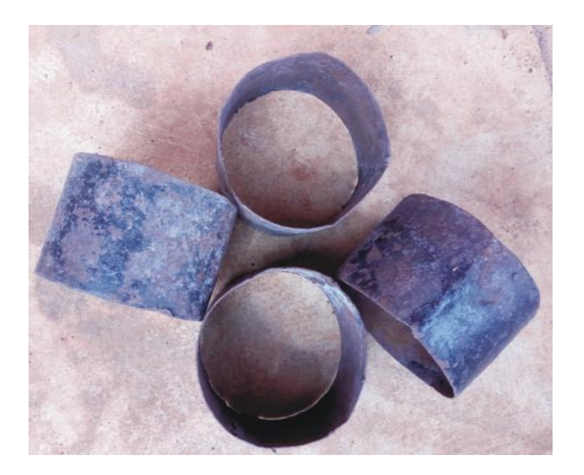
Plate 2: The moulds