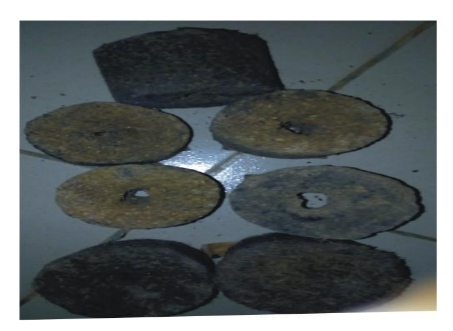
Plate 3: The Produced Briquettes