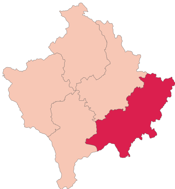
Figure 1. Geographical Location of Eastern Region in Kosovo