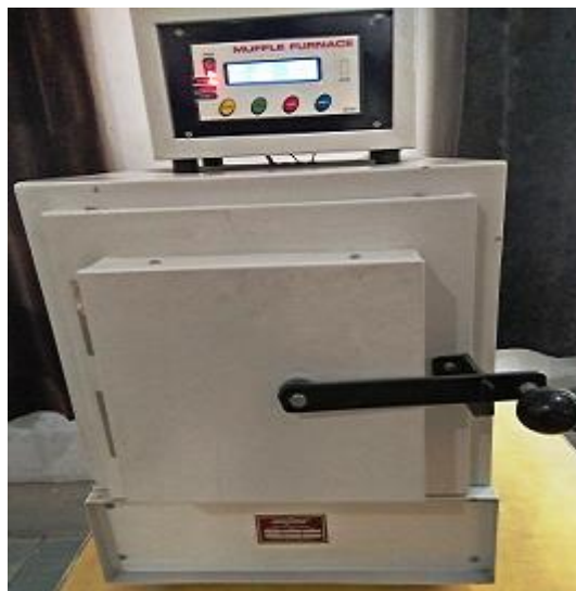
Fig. 2 Furnace