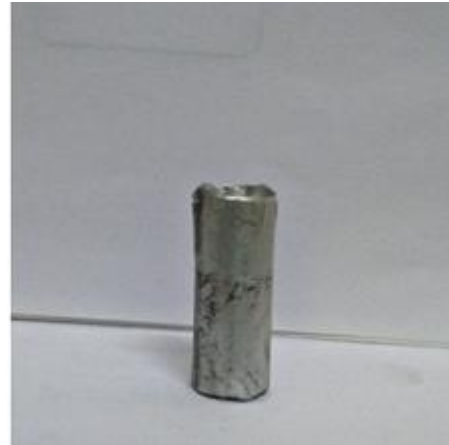
b) Zinc oxide powder