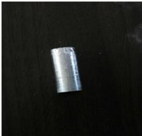
Fig. 3 Billets of a) Pure Al powder

The purpose of sintering was to increase the strength and toughness of billets as well as grain reformation by heating. Furnace was set at 300° C which is the nearby temperature of sintering temperature of aluminium. Billet was placed inside the furnace in a ceramic utensil and allowed to be heated for 30 minutes. The heated billet was put again in the dies and compressive load was applied till the displacement of UTM arm became constant. This was done for further refinement in mechanical properties of billet. The compression after heating ensures the proper compaction of molecules for a long period of time. After the compaction and sintering the prepared samples as shown in Fig 3 were passed through the ECAP die for further grain refinement.