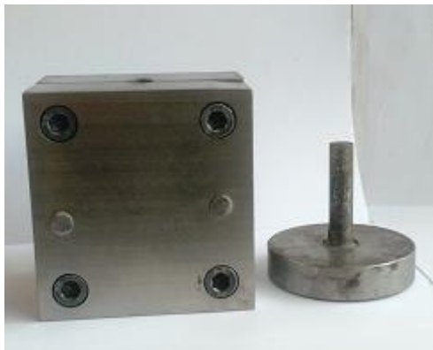
Fig. 1 a) Actual die for compaction

A die was designed for compaction. D3 die steel material was taken for making two die halves & top and bottom plunger. UTM (Universal testing machine) used for applying pressureduring compaction. Fig. 1 shows the complete die assembly and Fig. 2 shows the furnace. Parallel channel of 13mm was cut in the centre of die parts. Diameter of plunger was taken 12.7mm. Hot furnace was used for further heating of compressed billet up to nearly 80% of their melting temperature. Two types of billets using aluminum 99.999% purity powder were formed. One was formed from the fine aluminum powder and the other from aluminum powder mixed with Zinc oxide powder in 10:1 wt/wt ratio as an additive. The fine aluminum powder and zinc oxide were of 325 meshes. Volume and density relation was used for calculating amount of power required for compaction. We compressed 10gm pure aluminum powder for first sample and for the second sample mixed 10gm of aluminum powder and 1gm of zinc oxide together to form a homogenous mixture by ultrasonication in the dispersion agent. A load of 50KN to 100KN was applied during compaction.