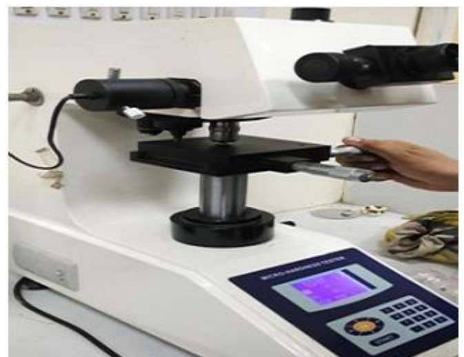
Fig. 5 Vickers's Hardness Tester

D3 die steel was used for ECAP. Die geometry was a key factor for introducing strain in bulk materials. ECAP die was having 110° die channel angle and 35° back angle. Various route can be adopted for further processing after PM [14]. Only two passes through the ECAP die were possible, after that the crack starts to appear. Route BC (Sample rotated 90° in the same direction) was adopted for second pass. Fig 4 shows the die geometry. During eve-