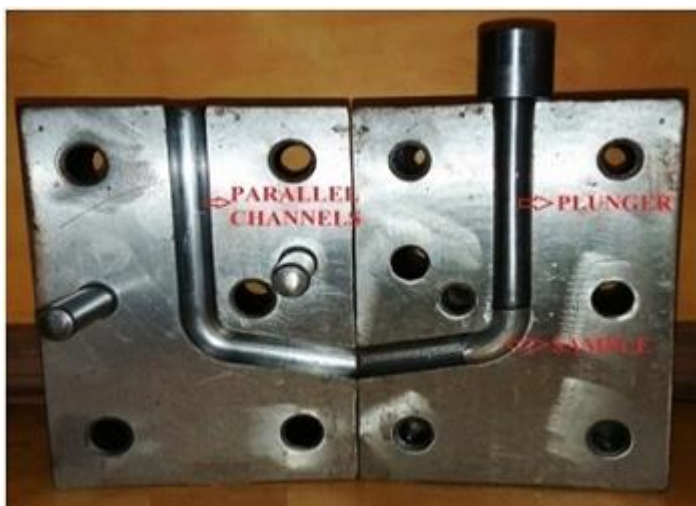
Fig. 4 ECAP Die