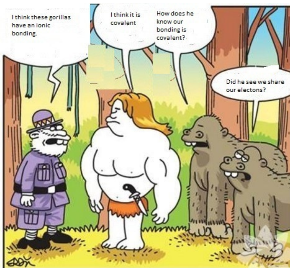
Figure 1: An example concept cartoon used in the experimental group.

Concept cartoons were created by the researcher and the figures were taken from internet websites, then the dialogue parts were written by the researcher. After that concept cartoons were examined how they fit with this study by four chemistry education experts.