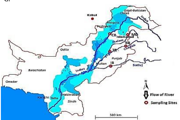
Figure 1. Geographical Map showing sampling sites

Total of 177 individuals of W. attu were collected from five major riverine sites of Punjab, Pakistan (Fig. 1) i.e. Mangla Dam (MD), Head Marala (HM), Chashma Barrage (CB), Ismail Barrage (IB) Baluki Barrage (BB). The populations were named after the initial letters of sampling localities. Fish samples were placed in crushed ice boxes by keeping them polyethylene bags which were tagged according to sampling site for identification. Fish samples containing boxes were transported to Aquaculture Biotechnology Laboratory, Department of Zoology, Wildlife and Fisheries, University of Agriculture Faisalabad for freezing at -20 °C.