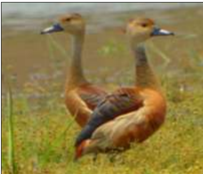
Fig. 5: Lesser Whistling Duck