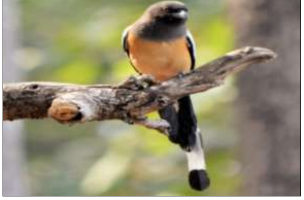
Fig. 7: Rufous Treepie