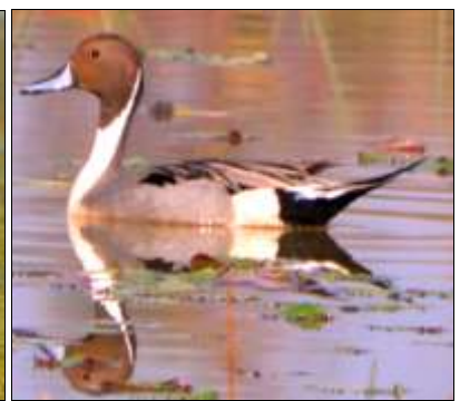
Fig. 6: Northern Pintail