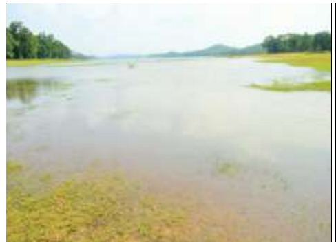
Fig. 4: A View of Bodalkasa Lake

Ardeidae was the dominant family with 07 species and followed by the family Anatidae with 06 species. The highest RDi value (10.14) was recorded for Ardeidae family (Table 2). Further investigation reveals that the Columbidae family with (4 species), Ciconiidae, Charadriidae, Scolopacidae, Alcedinidae, Corvidae, Sturnidae and Motacillidae with (3 species each), Threskiornithidae, Phalacrocoracidae, Psittacidae, Picidae, Oriolidae, Timaliidae Cuculidae. Muscicapidae with (2 species each), Anhingidae, Recurvirostridae, Coraciidae, Meropidae, Upupidae,