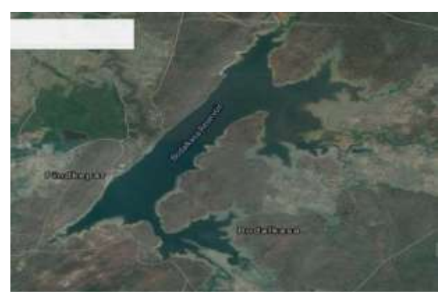
Fig. 3: A Satellite View of Bodalkasa Lake

The Bodalkasa reservoir is located near Bodalkasa village at coordinates of 21°21′151" N latitude and 80°01′00"E longitudes and constructed as a part of irrigation projects in 1917 on Bhagdeogoti - a local nala near Tirora having 539 hectares area. This reservoir locally called as Bodalkasa lake and famous as picnic spot, for the irrigation purposes, fishing activities, various wild animals and avifaunal diversity. Gondia is known as the district of lakes as there are many water bodies including lakes and reservoirs present in the district. Apart from this there are many large dams such as Itiyadoh, Shirpur, Pujaritola, Kalisarad as well as smaller dams, reservoirs or lakes at Chorkhamara, Bodalkasa, Navegaon, Shrungar-