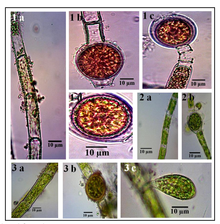
PLATE I: Oedogonium Link ex Hirn

Gujarat, Kerala, Uttar Pradesh (Gonzalves, E. A., 1981)