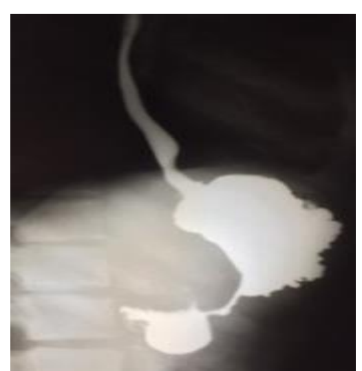
Fig. 5: Continuous filling of the esophagus and stomach suggesting involvement of the gastric esophageal junction

The barium swallow examination revealed smooth narrowing of lower third of the esophagus with minimal dilatation of the upper third (Fig. 4). No peristalsis was noted in the esophagus and there was no obstruction to the passage of the contrast in to the stomach. The study was extended to evaluate the stomach and duodenum, which revealed a small sized, contracted, aperistaltic stomach with presence of multiple ulcers at the greater curvature and gross narrowing at the gastric pylorus and antrum (Fig. 5 and Fig. 6).