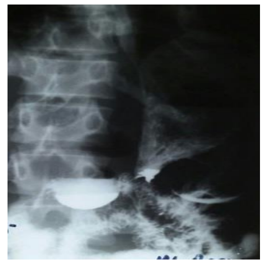
Fig. 7: Barium Meal examination of Case 3

The study revealed normal passage of barium through the esophagus with no narrowing or filling defects. The stomach was however, reduced in size with no peristalsis. The gastric mucosa was completely effaced with narrowing and ulceration at the antrum (Fig. 7).