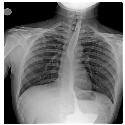
Fig. 1: Barium Swallow examination of Case 1

The barium swallow study revealed smooth narrowing of the lower half of the thoracic esophagus with minimal dilatation of the proximal segment. Visualized portion of stomach revealed complete effacement of gastric rugae (Fig. 1).