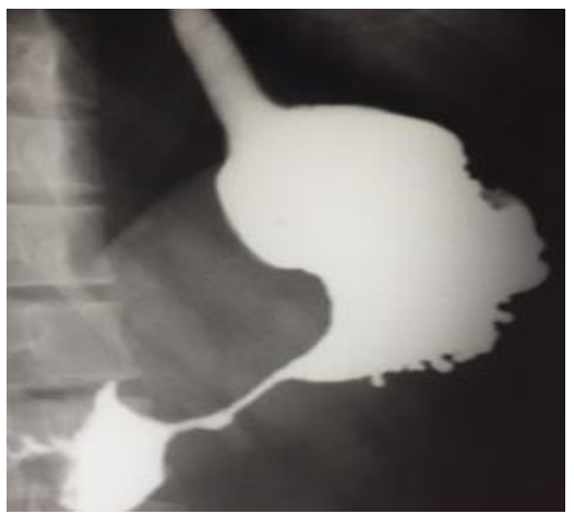
Fig. 6: Delayed film with same findings