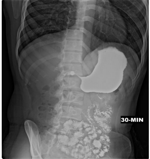
Fig. 3: Gross antral and pyloric narrowing and delayed passage of the barium contrast

Evidence of gross narrowing of pylorus of stomach with delayed passage of barium through the duodenum was noted (Fig. 3). Thus the diagnosis of benign stricture of the esophagus and corrosive stricture of antrum of stomach with linitis plastic type appearance of stomach due to corrosive poisoning was made.