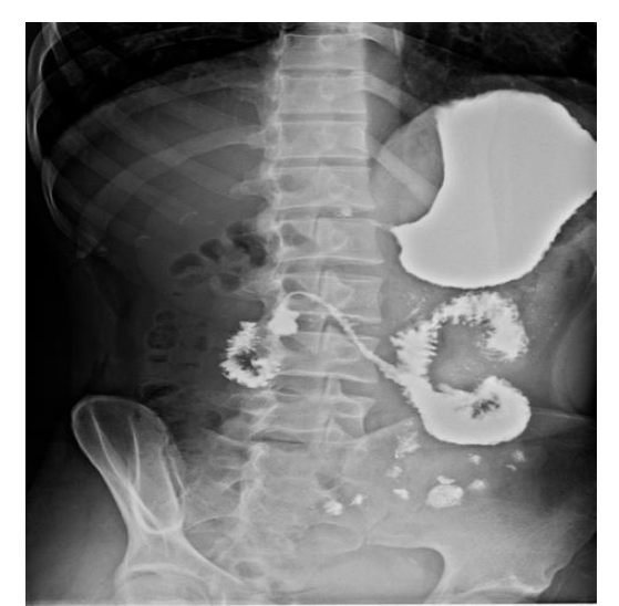
Fig. 2: Small sized stomach with smooth contours, loss of peristalsis and antral narrowing

Evidence of gross narrowing of pylorus of stomach with delayed passage of barium through the duodenum was noted (Fig. 3). Thus the diagnosis of benign stricture of the esophagus and corrosive stricture of antrum of stomach with linitis plastic type appearance of stomach due to corrosive poisoning was made.