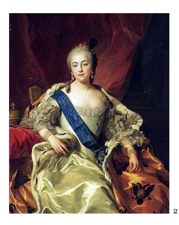
Fig. 4. Empress Maria Theresa of the Holy Roman Empire, Great Princess of Transylvania (1) Empress Elisabeth of Russia (2).