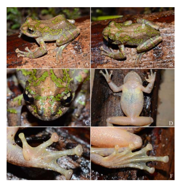
Figure 2 Different views of the holotype (KIZ 016395) of Nasutix alus medogensis sp. nov. in life A: dorsolateral view; B: dorsal view; C: dorsal view of head; D: ventral view; E: ventral view of hand; F: ventral view of foot.