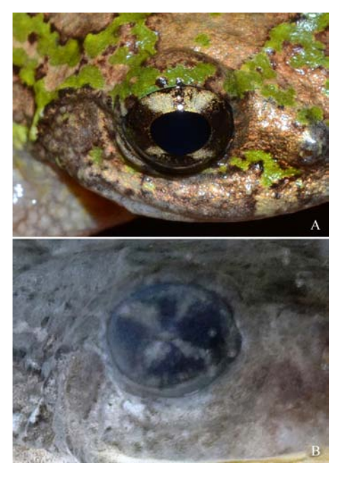
Figure 4 Right eye of the holotype, showing the iris with a pale yellow, "X" shaped pattern of pigmentation, in life (A) and preservative (B)

Skin of dorsal surfaces of head, body and limbs relatively smooth, with small tubercles scattered; loreal and temporal region, and lateral body rough, with distinct tubercles; ventral surface with serried flat tubercles, relatively small on throat, chest and ventral forelimbs, relatively large on belly and ventral thigh; tubercles on basal ventral thigh prominent.