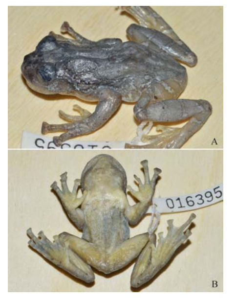
Figure 3 Different views of the holotype (KIZ 016395) of Nasutixalus medogensis sp. nov. in preservative A: dorsolateral view; B: ventral view.

Skin of dorsal surfaces of head, body and limbs relatively smooth, with small tubercles scattered; loreal and temporal region, and lateral body rough, with distinct tubercles; ventral surface with serried flat tubercles, relatively small on throat, chest and ventral forelimbs, relatively large on belly and ventral thigh; tubercles on basal ventral thigh prominent.