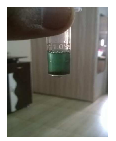
Figure 5: Formation of Precipitation after 30 mins Figure 6: Rising of Pellet after Addition of Crystal

NASS Rating: 3.30 - Articles can be sent to editor@impactjournals.us