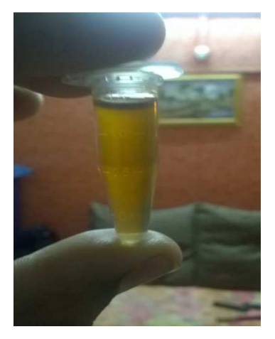
Figure 3: Holy Basil's Leaves Extract