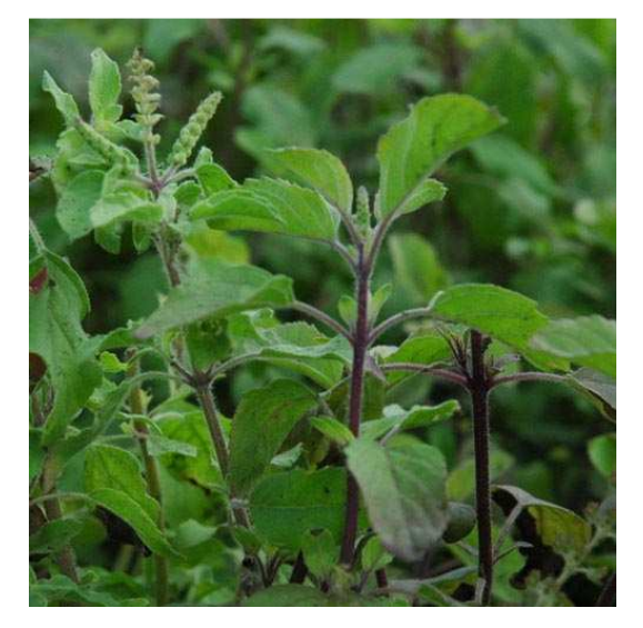
Figure 2: Holy Basil (Ocimum tenuiflorum)

Dioxygen is used in cellular respiration and many major classes of organic molecules in living organisms contain oxygen, such as proteins, nucleic acids, carbohydrates, and fats, as do the major constituent inorganic compounds of animal shells, teeth, and bone. Most of the mass of living organisms is oxygen as a component of water, the major constituent of lifeforms. Conversely, oxygen is continuously replenished by photosynthesis, which uses the energy of sunlight to produce oxygen from water and carbon dioxide. Oxygen is too chemically reactive to remain a free element in air without being continuously replenished by the photosynthetic action of living organism. Plants need oxygen to survive but the difference is in day time they uses carbon dioxide and sunlight for the photosynthesis process and emits oxygen out but in the night time due to absence of sunlight plants takes oxygen and gives out carbon dioxide.<sup>[4]</sup>