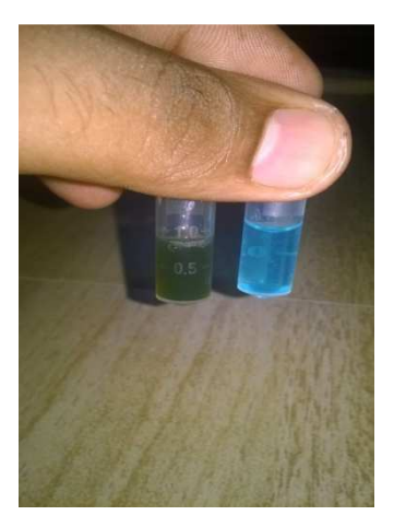
Figure 4: Green Solution and CuSO<sub>4</sub>