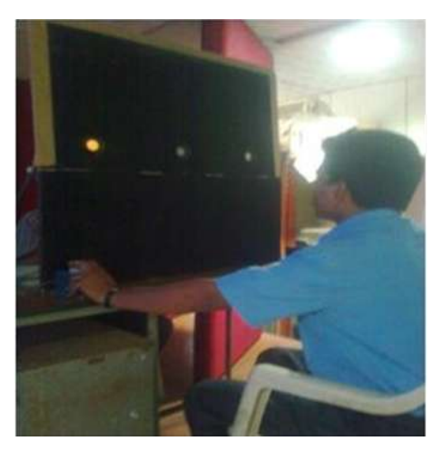
Fig. 2: Discrimination Reaction Time (DRT) equipment