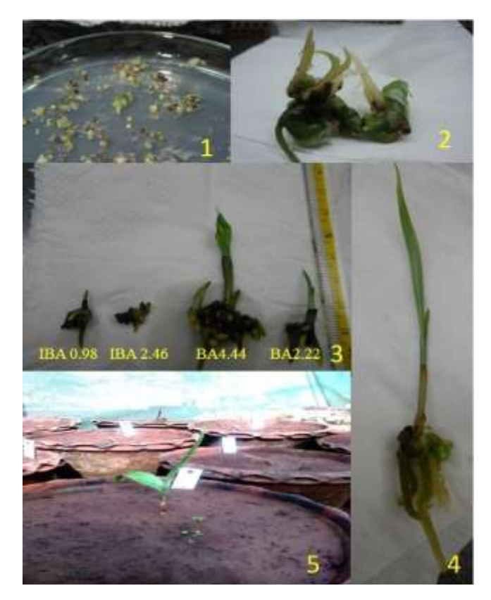
Fig. 1: 1.Germinating seeds, 2. In-vitro produced rhizomes,3. Effect of IBA and BA on development of shoots and roots, 4. Plantlet ready for hardening, 5. Acclimatized plant of Eulophia nuda

Seed germination started relatively slowly within 8-9 weeks of culture where embryos swelled and broke out of the testa, and then formed green protocorms after 11-12 weeks of sowing. The germination of nongerminated seeds continued for a prolonged period of time lasting more than 10-12 months. Similar observations are reported in Dactylorhiza futchsii , (Jakobson 2008), where seed germination continued for almost 2.5 years under in-vitro conditions. The protocorms take 4 weeks to develop chlorophyll, as evident in most of the terrestrial orchids (Dressler, 1990) in contrast with Bletilla , Thunia and Cymbidium , where early in germination; chlorophyll appears in the protocorm cells as described by Yakovlev and Zhukova (1973).