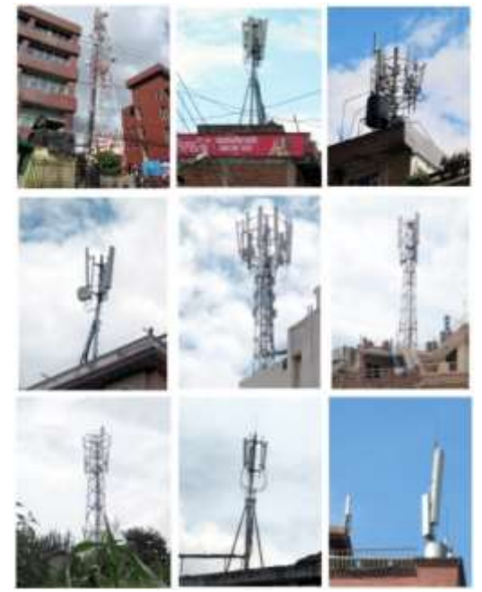
Fig. 4: Different types of the antenna structures found in the survey