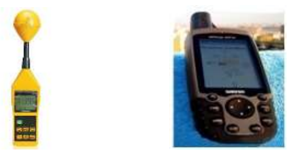
Fig. 1: Tenmars, TM-196 (RF Detector) Fig. 2: GPS Map60CSx

time in all weather conditions, anywhere on or near the earth where there is an unobstructed line of sight to four or more GPS satellites, is used to measure the distance of the observation point from the base of the cell phone tower.