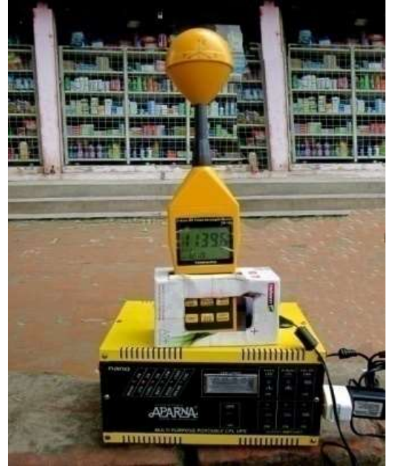
Fig. 3: Experimental arrangement of the apparatus during survey time

location (Site). The towers were selected from least populated, medium populated and highly populated area having different services across the site. To compare the Power density radiated from the cell phone towers to the background radiation level i.e. radiation level far away from the cell phone towers but having cell phone network, 10 different places of the Kathmandu valley without nearby cell phone tower but with cellular network were selected and the instantaneous value of the Power density for 15 minutes in the interval of the 30 seconds and average value of the power density in the interval of 6 minutes was recorded in those sites. Also, average value of the Power density was recorded around the antennas of the Sagarmatha Satellite Transmission Station, Balambu, Kathmandu.