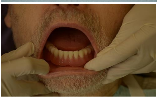
Figure 7a, b; (a) Metal housings built in metal base lower denture (b) Dentures in patient's mouth