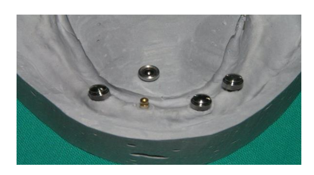
Figure 6; laboratory implants and placed metal housings