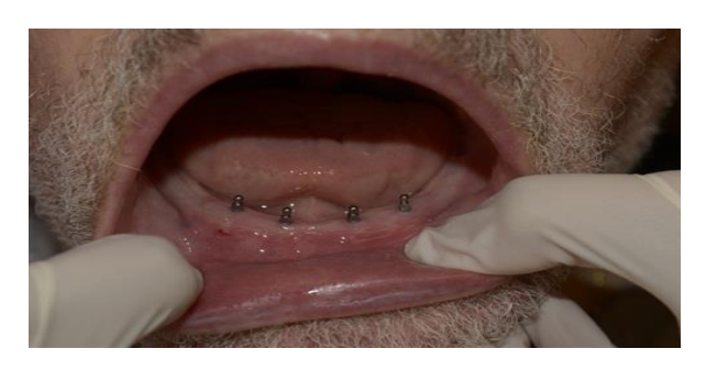
Figure 4.; Placed mini dental implants

The laboratory implants were inserted into the impression copings (Figure 6), and the models were poured in hard stone. Micro metal housings were placed onto the laboratory implants, and the metal base of the lower overdenture was produced. Further clinical and laboratory procedures were performed according to the routine procedure for lower denture production. Figure 5,6