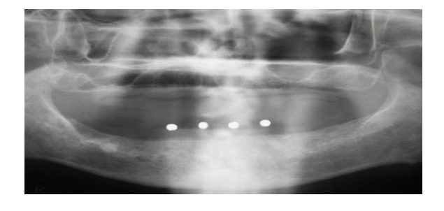
Figure 1; Orthopantomograph with visible lead markers

Patient in the age of 54came for examination in our clinical department. He was not satisfied with the existing removable dentures, especially the lower one. He had been informed about the possibilities of implant therapy and fixed prosthodontic construction, but he could not afford it. Figure 1,2