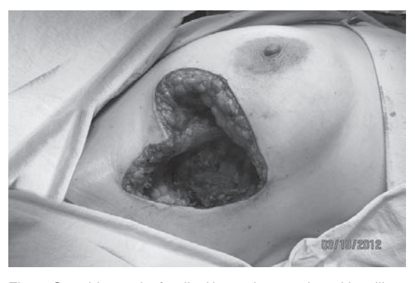
Fig. 3. On-table result of radical breast's resection with axillary lymphadenectomy.