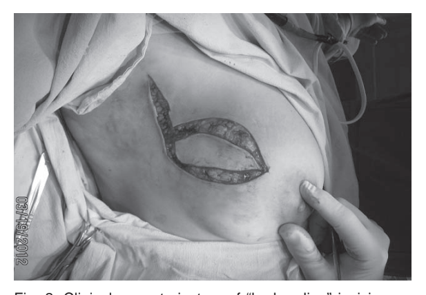
Fig. 2. Clinical case: trajectory of "broken line" incision on axilla and breast.

Surgery. The operative designs made in upright position of patient marking tumor's projection on skin with help of breast ultrasound. Oncoplastic breast resection was started with incision of the skin and soft tissues in axilla along the pectoral muscle downward to the lateral contour of breast, and then changed direction at an angle of 120° towards areola (Fig. 2). The tumor projection was embraced by two semi-oval incisions, and then partial breast resection with axillary lymphadenectomy was done (Fig. 3). After morphological confirmation of "clear" margins in surgical specimen the wound was sewn along the trajectory of the incision (Fig. 4). Surgical specimen: a tumor size of 5×7 mm at a distance of 2.0 cm to the margins of resection, with adequate volume ratio "tumor - to - breast tissue". The 11 lymph nodes ranging in size from 5 to 15 mm were present in axillary fat (Fig. 5). Histology: invasive ductal carcinoma, grade G2; lymph nodes with hyperplasia and angiomatosis; margin tissues histologically negative. Immunohistochemistry: ER-, PR-, Her2-