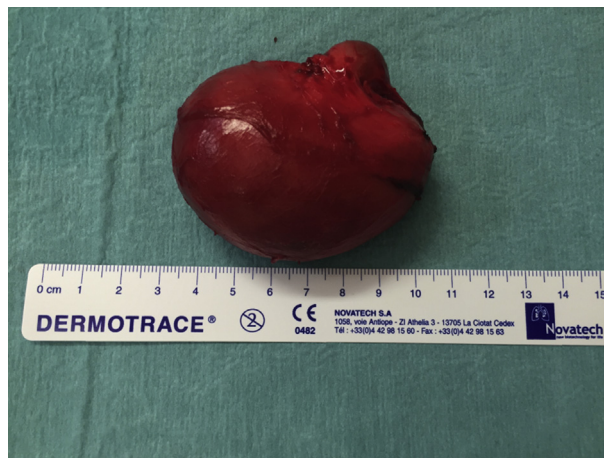
Figure 3. The cyst measuring 7 cm.

Female genital mutilation is a cultural practice characterizing a lot of African and Asian societies. This clinical entity can be seen in occidental countries among immigrant communities [1]. According to the World Health Organization (WHO) guidelines, the classification of female genital mutilation is based on four types: Type I (clitoridectomy) a partial or total removal of the clitoris and, rarely, the prepuce as well; type II (excision) is the partial or total removal of the clitoris and the labia minora, with or without excision of the labia majora;