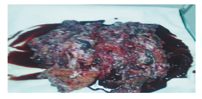
Figure 3. irregularly shaped mass of necrotic tissue with multiple grapelike vesicles.