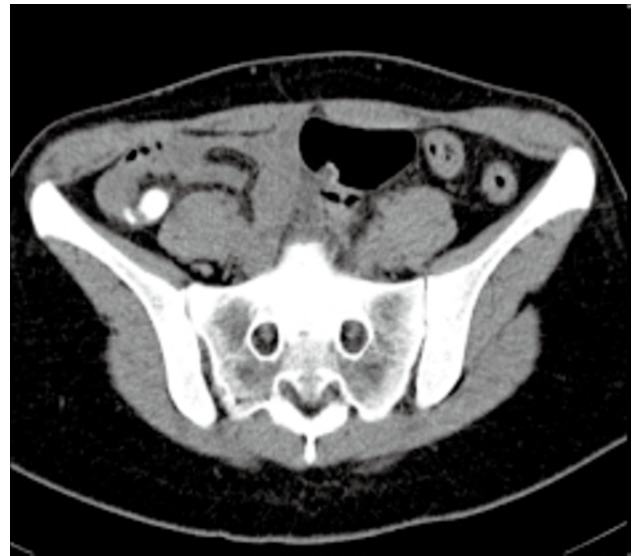
Figure 2. Pelvic CT with two calcified masses in enlarged non-inflamed appendix. This figure shows, on computed tomography (CT), a calcified density in the right abdomen.

An operative laparoscopic appendectomy was performed to remove the mass, which was not associated with surrounding normal female pelvic anatomy. Histopathology was consistent with an NET-A with negative margins extending to the serosa. The patient's postoperative course was unremarkable. Two months following her appendectomy, the patient conceived spontaneously and subsequently delivered a health infant at term.