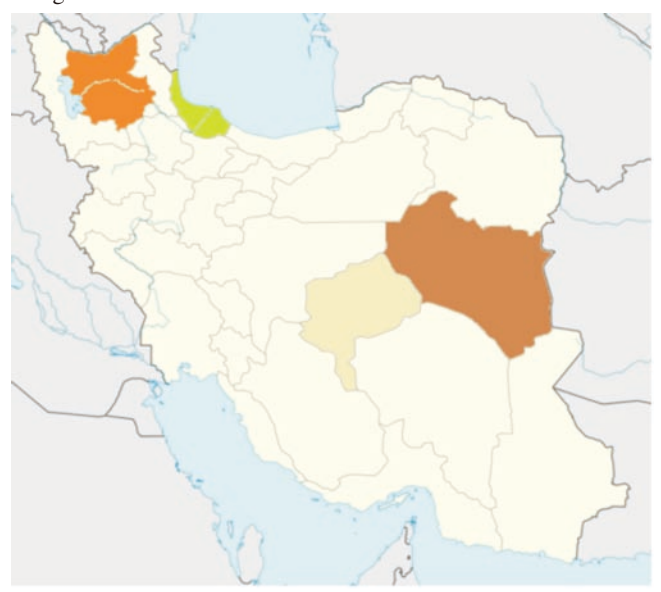
Figure 1. The areas of study including East Azerbaijan, Gilan, Yazd and South Khorasan Provinces marked on the map of Iran as orange, green, cream and brown respectively.

hot and dry climate in sand dunes region) and East Azerbaijan Provinces (cool and dry climate in mountainous region) in Iran (Figure 1). The sampling period commenced in January 2011 and ended in December 2011. Sampling was undertaken in different types of livestock found in stables situated in randomly chosen villages.