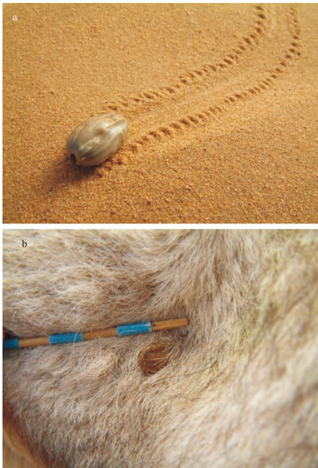
Figure 3. The camel tick, Hyalomma dromedarii (a), feeds mainly on camels (b), even if other domestic animals can be also used as hosts, nymphs and larvae parasitizing the same hosts as adults, especially camels, as well as birds, rodents and hedgehogs. This tick plays a key role in transmitting the bovine tropical theileriosis, a haemoprotzoan disease caused by Theileria annulata.

and the preservation of ethnobotanical information on the repellent and acaricidal potential of plants is crucial. Current knowledge concerning the effectiveness of plant extracts as acaricides and/or repellents against tick vectors of public health importance has been recently reviewed[3], with special emphasis to Ixodes ricinus , Ixodes persulcatus , Amblyomma cajennense , Haemaphysalis bispinosa , Haemaphysalis longicornis , Hyalomma anatolicum , Hyalomma marginatum rufipes , Rhipicephalus appendiculatus , Rhipicephalus (Boophilus) microplus , Ranunculus pulchellus , Rhipicephalus sanguineus and Rhipicephalus turanicus . Study by Benelli et al. [3] identified 83 plant species from 35 botanical families. The most frequent botanical families exploited as sources of acaricides and repellents against ticks are Asteraceae (15% of the selected studies), Fabaceae (9%), Lamiaceae (10%), Meliaceae (5%), Solanaceae (6%) and Verbenaceae (5%). In the above-cited systematic review, regression equation analyses showed that the literature on botanicals and tick control grew by approximately 20% per year, from 2005 to 2015[3].