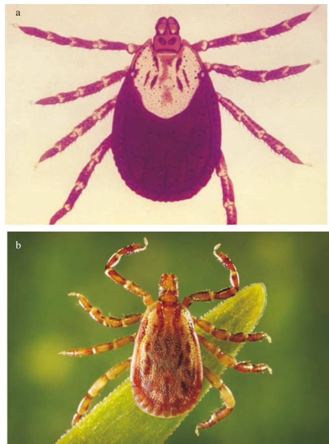
Figure 2. A female Rocky Mountain wood tick, Dermacentor andersoni (a), and a male yellow dog tick, Amblyomma aureolatum (b).

in many parts of the world for over 50 years before resistance to the chemical became a problem. Since the discovery of organochlorines, virtually every chemical group of pesticides developed for the control of arthropods represented among the list of products employed for the control of ticks on cattle[17]. In recent years, effective improvements in the development of acaricides with low mammalian toxicity (e.g. pyrethroids and avermectins) enhanced the efficacy of treatments against ticks, but at greatly increased cost[9]. Furthermore, the evolution of tick resistance to acaricides has been a major determinant of the need for new products[17]. In addition, a number of problems are associated with the use of acaricide, such as environmental pollution, contamination of meat and milk from livestock and expense especially in the developing world[3,18].