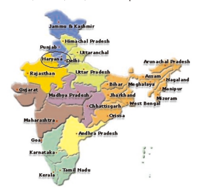
Figure 1 Map of studied rural area of Haryana

the rural region nearby Ambala where the patients come for treatment within the radius of 30 km. A total of 18021 patients cases were studied under retrospective study. The patients with were only higher than normal glucose level considered as diabetes mellitus. To find out the sample size, the formula used n= pq(1.96)2/(d)2, where p = prevalence of hypertension in a rural population of Haryana was 10% [7] with 95% confidence level and 90% power. The study was approved by Human Ethical Committee of M M Institute of Medical Science and Research, Mullana (IEC/30) before the experiment start.