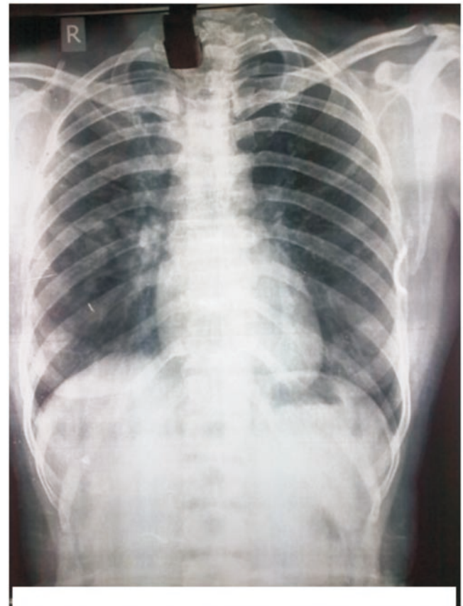
Figure 3. Chest radiograph posterior view after 4 months of itraconazole therapy (significant radiological resolution).

A diagnosis of fungal lung disease ( A. boydii ) was made and the patient was initiated on oral itraconazole 200 mg bid for 6 months with close clinico–radiological monitoring. She was also given advice of cessation of exposure to cow dung, change of work and use of preventive measures. Unfortunately, the patient had not yet changed her work profile. There was significant clinico–radiological improvement at four months of therapy. She has gained weight, and improved appetite with improvement of symptoms along with decrement in radiological shadows (Figure 3).