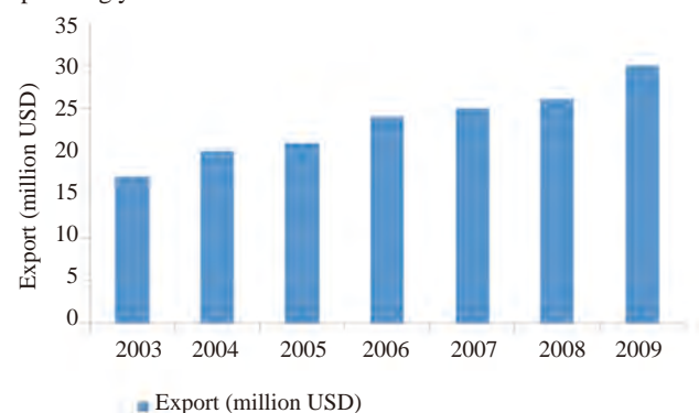
Figure 2. Trend of export of pharmaceutical products in Bangladesh.

countries like Vietnam, Singapore, Myanmar, Bhutan, Nepal, Sri Lanka, Pakistan, Yemen, Oman, Thailand, and some countries of Central Asia and Africa. The country is also expanding its market in the European countries as well[10]. The export in 2003 was approximately 17 million USD, which increased to 30 million USD by the year 2009 (Figure 2). It is highly expected by various industry analysts and experts that this rising trend will continue in the upcoming years as well.