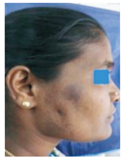
Figure 4. Post therapy complete resolution of swelling.