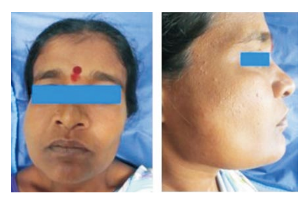
Figure 1. Swelling on the middle one third of right side of face.

Clinical examination revealed a diffuse extra oral swelling located 2.5 cm away from the anterior tragus of the right ear, measuring approximately 2.0 cm×2.5 cm. Skin over the swelling was normal in colour. On palpation swelling was firm in consistency, non tender, no rise of local temperature and non-fluctuant (Figure 1).