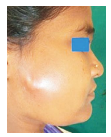
Figure 3. Second visit revealing reinfection of the swelling.