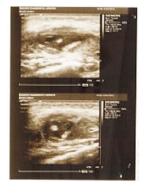
Figure 2. Ultrasound showing partially collapsed intramuscular cystic lesion measuring about 7.9 mm×4.2 mm with mural calcified nodule within the lesion.

Ultrasound examination revealed a partially collapsed intramuscular cystic lesion measuring about 7.9 mm×4.2 mm seen in right cheek and mural calcified nodule was noticed within the lesion. A diagnosis of intramuscular cysticerosal cyst was given by radiologist (Figure 2).