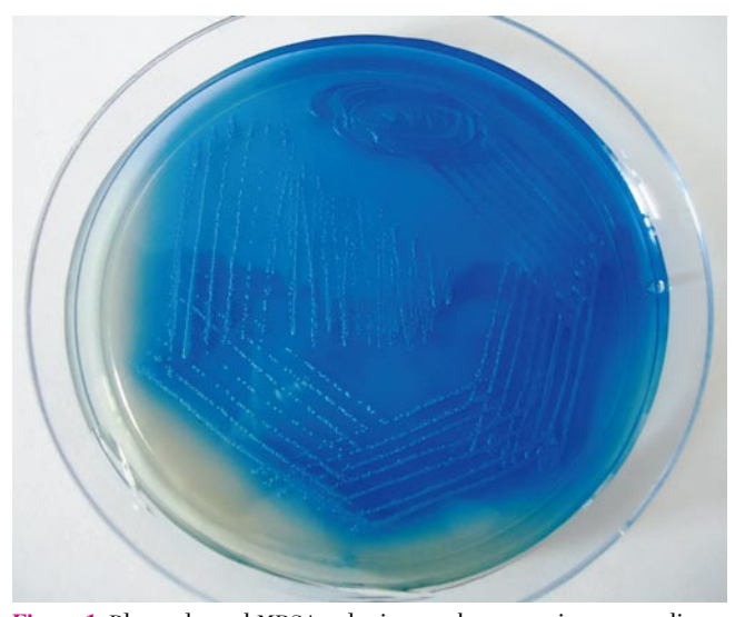
Figure 1. Blue coloured MRSA colonies on chromogenic agar medium.

The standard MTCC number 7443 strain and all the isolated S. aureus strains were subjected to antibiotic sensitivity tests with 16 antibiotics, by the Kirby-Bauer's method (disc diffusion) detailed previously[7]. For the detection of MRSA, chromogenic agar media test was used; pure clinical isolates of S. aureus were streaked onto MRSA-agar media (Hichrome-MeReSa agar media, HiMedia, Mumbai) and were incubated for 24 h at 37°C; MRSA strains had blue colonies (Figure 1) and non-MRSA strains had white colonies. Further, for the "cefoxitin disc diffusion test", all the isolates were subjected to cefoxitin 30 µg/disc. A 0.5 McFarland standard suspension of an isolate was made and lawn culture was done on Muller-Hinton agar (MHA) plate. Plates were incubated at 37°C for 18 h and inhibition-zone diameters were measured. A value of inhibition-zone diameter less than 22 mm was reported as oxacillin resistant and that more than 21 mm was considered as oxacillin sensitive<sup>[3,11]</sup>.