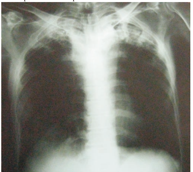
Figure 2. Chest radiograph showing bilateral upper zone fibrosis suggestive of old Koch's.

reflexes in right upper and lower limb. Planter response was extensor on the right side and flexor on the left side. There was no sensory neurological deficit. The rest of the CNS examination was normal. A CT scan of cranium with contrast (Figure 1) was done which showed multiple hypodense rim enhancing lesion in right frontal, right parieto occipital and high parital on left side with white matter edema causing mass effect in the form of effacement of ipsilateral occipital and frontal horns of lateral ventricle. The fundus examination showed mild papilloedema changes. Chest radiograph (Figure 2) showed bilateral upper zone fibrosis suggestive of old Koch's. The patient was put on CAT II AKT as per revised national tuberculosis control programme (RNTCP) guidelines. He was also put on Mannitol drip to reduce intracranial tension and injection of dexamethasone was given to reduce cerebral edema. The patient responded within 2 weeks. The power in both right upper limb and lower limb was grade 4 on discharge. The drowsiness was also improved and the patient became alert.