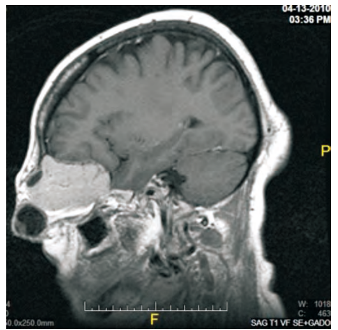
Figure 3. Left sagittal T1-weighted MRI (post Gadolinium)heterogenously hyperintense lesion in the retro-orbital region which is pushing the globe downward.