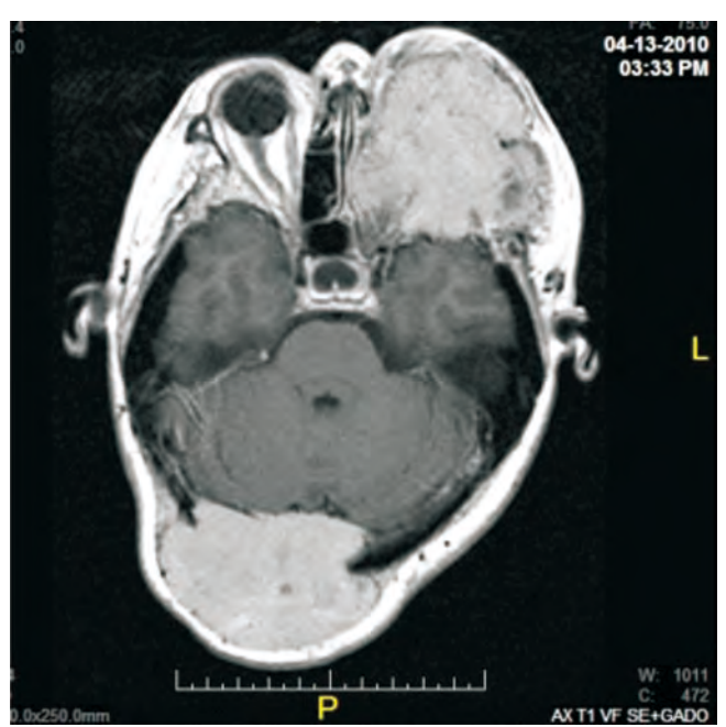
Figure 4. Axial T1–weighted MRI (post Gadolinium)– showing mass in the orbit as well as occipital region.