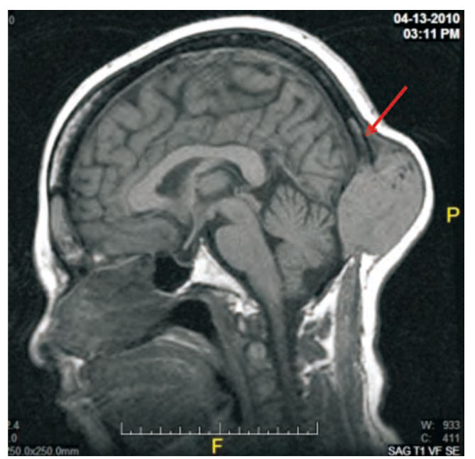
Figure 2. Left sagittal T1-weighted MRI (non-contrast)-an isointense extra-axial mass lesion in the occipital region with a dural-tail.