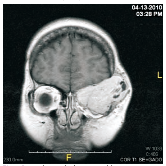
Figure 5. Coronal T1-weighted MRI (post Gadolinium).

She was noted to have a vision of 6/45 pinhole 6/30 in her left eye and non-axial proptosis with dystopia (the globe was markedly displaced downward (Figure 1). There was evidence of compressive optic neuropathy with positive relative afferent pupillary defect, red desaturation, reduced light sensitivity, dyschromatopsia and optic disc swelling, as well as exposure keratopathy. Her right eye was normal with a 6/6 visual acuity. The intraocular pressure was normal bilaterally. There was a firm mass measuring 8 \times 6 cm over the occipital region.