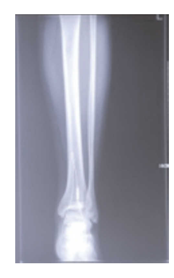
Figure 12. Anteroposterior ankle X-ray 2 months after surgery.

Take one patient for example, two months after surgery, the patient was taken X-ray pictures in anteroposterior and lateral positions, respectively (Figures 12, 13), and meanwhile, his apparent picture about wound healing was also taken (Figure 14). All of them illustrated that his postoperative recovery was pretty good.