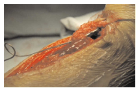
Figure 4. Two lock catches were fixed tightly with a forceps clip.