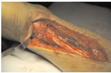
Figure 5. Two broken ends were sutured carefully with absorbable catgut.