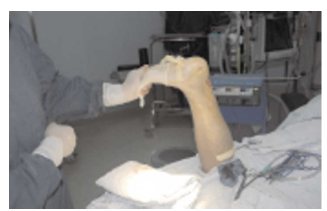
Figure 6. Extreme dorsal flexion of ankle joint after surgery suggested that the patient after surgery can immediately get 90 ℃ functional position and overcome the resistance.