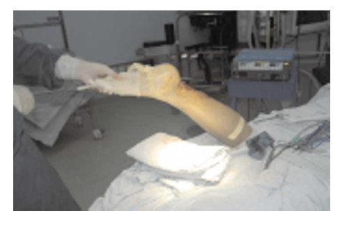
Figure 7. Plantar flexion of ankle joint after surgery.