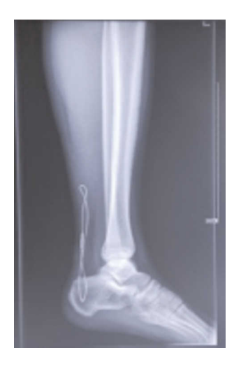
Figure 13. Lateral ankle X-ray 2 months after surgery.