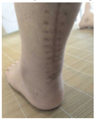
Figure 14. The wound healing condition 2 months after surgery.