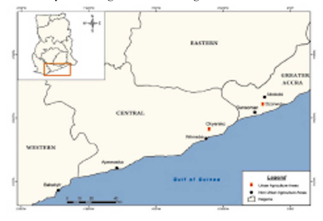
Figure 1. Map of Ghana showing sites where mosquitoes were collected for the insecticide susceptibility test.

Mosquito larvae were collected from ponds, polluted drains, choked gutters and rice fields from seven localities in southern Ghana. Collection sites were selected from different settings (Figure 1); urban and peri–urban, urban agricultural and commercial. Larvae were brought to the laboratory for emergence and testing of adults.