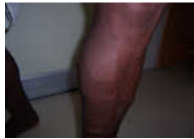
Figure 2. Muscle hypertrophy of both calves.