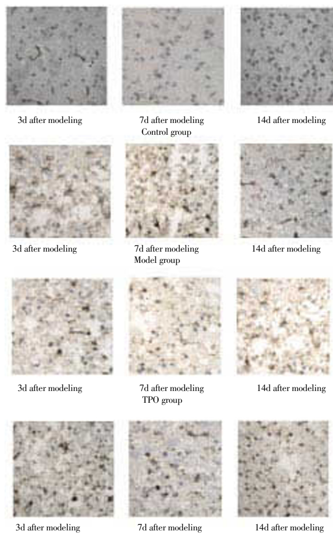
Figure 2. Expression of nestin cells in brain tissue at different time points.

visible within the cytoplasm, axons and dendrites in the model group on day 3 after modeling, increased slightly on day 7, and declined on day 14. In TPO group, the small amount of nestin positive expression was gradually declined with time. In G-CSF group, nestin protein positive expression on day 7 was significantly higher compared with that on day 3, and declined on day 14 (Figure 2).