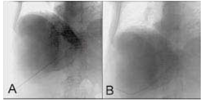
Figure 3. 82 year old women with percutaneously treated giant hepatic hydatid cyst (A). This patient was treated with catheterization (B). 43 mm×43 mm (300×300 DPI). This patient was treated with catheterization (B). 43 mm×43 mm (300 ×300 DPI).